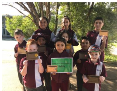
Safety Wk 10 T1