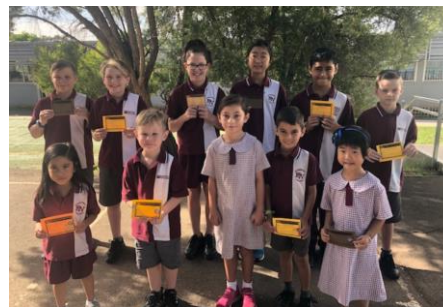
Respect Wk 11 T1