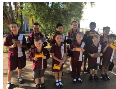
Responsibility Wk 9