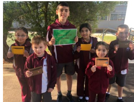
Safety Wk 3 T2