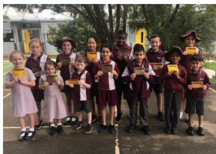
Effort Wk 8 T1

Every week a school value is announced as a focus and students are identified during that week as demonstrating the value. The Photo's below are the award winners.