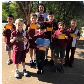
Responsibility Wk 2 T2