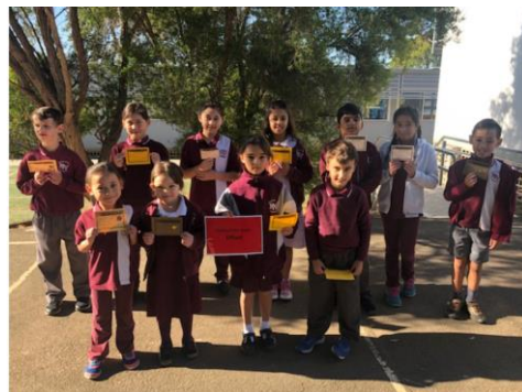
Respect Wk 4 T2