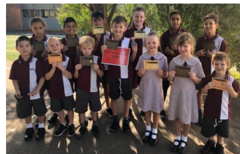
Effort Wk 3