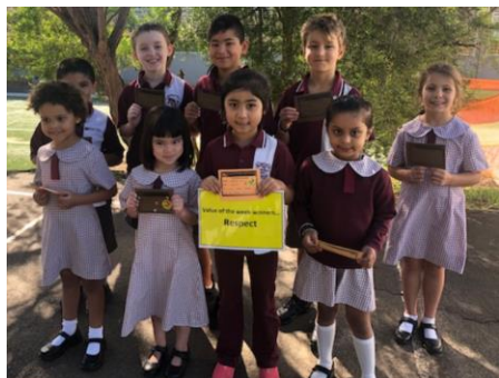
Respect Wk 2

Every week a school value is announced as a focus and students are identified during that week as demonstrating the value. The Photo's below are the award winners.