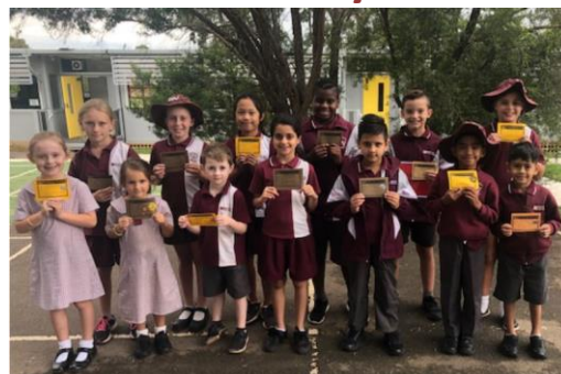
Responsibility Wk 7