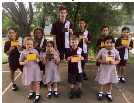
Effort Wk 6