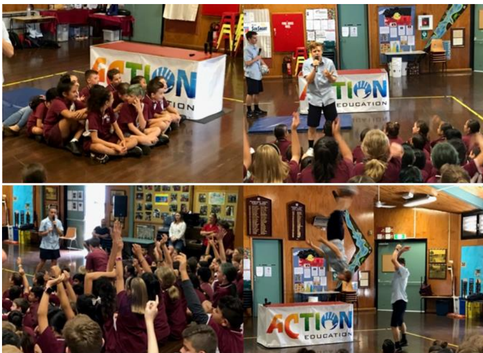
Penshurst West Anti – Bullying Incursion