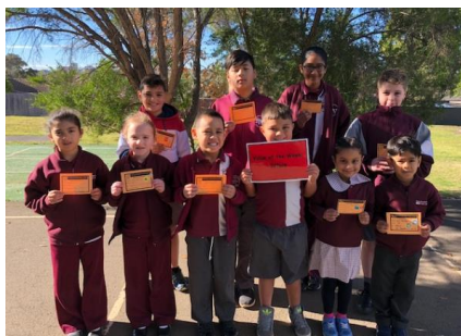
Effort Wk 3