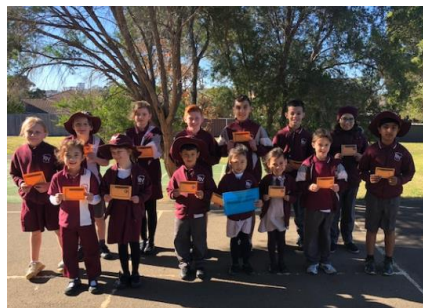
Responsibility Wk 4