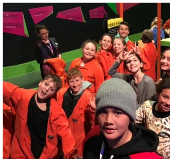
Fun in the Snow and at Questacon