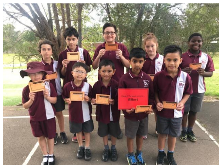
Week 5 – Effort