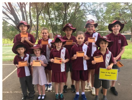
Week 6 - Respect