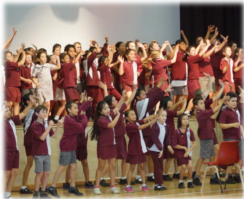
FINALE PRACTICE CONCERT 2014