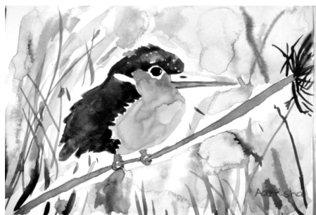
WORK FROM A STUDENT

Amy is a professional and a very experienced art teacher now with over 15 years of teaching specialized art and drawing lessons for children. Students will be taught the basic skills of drawing and cartoon design right up to professional sketching and painting. Children's future intellectual development will be improved with these life long skills.